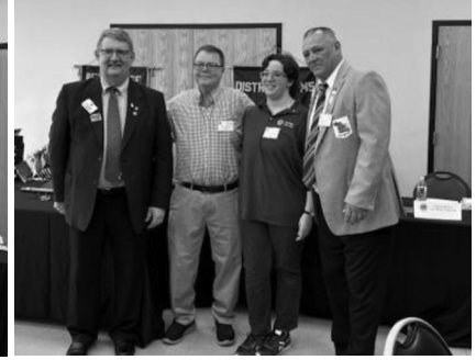
and a new Lion!