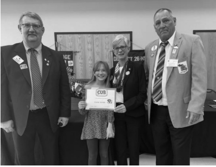
A new Cub,