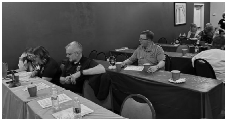
Music Bingo at the Hospitality Event