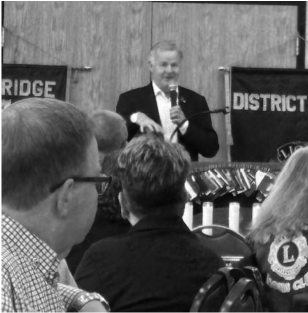
Welcome from the mayor