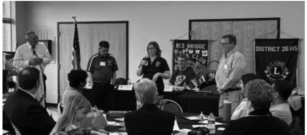
2025-2026 District Officers