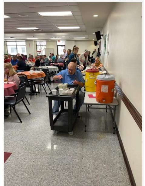
SKC Red Bridge Lions helped serve Thanksgiving meal at Alphapointe.